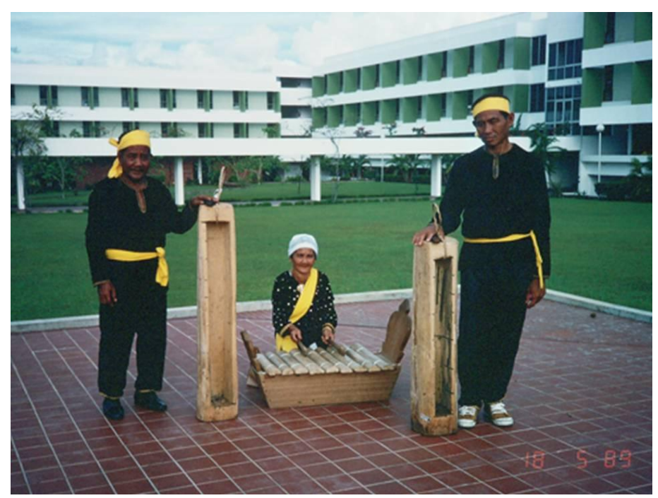
Photo 3: Sampasang No Gabang ensemble of gabang with two kantung slit gongs