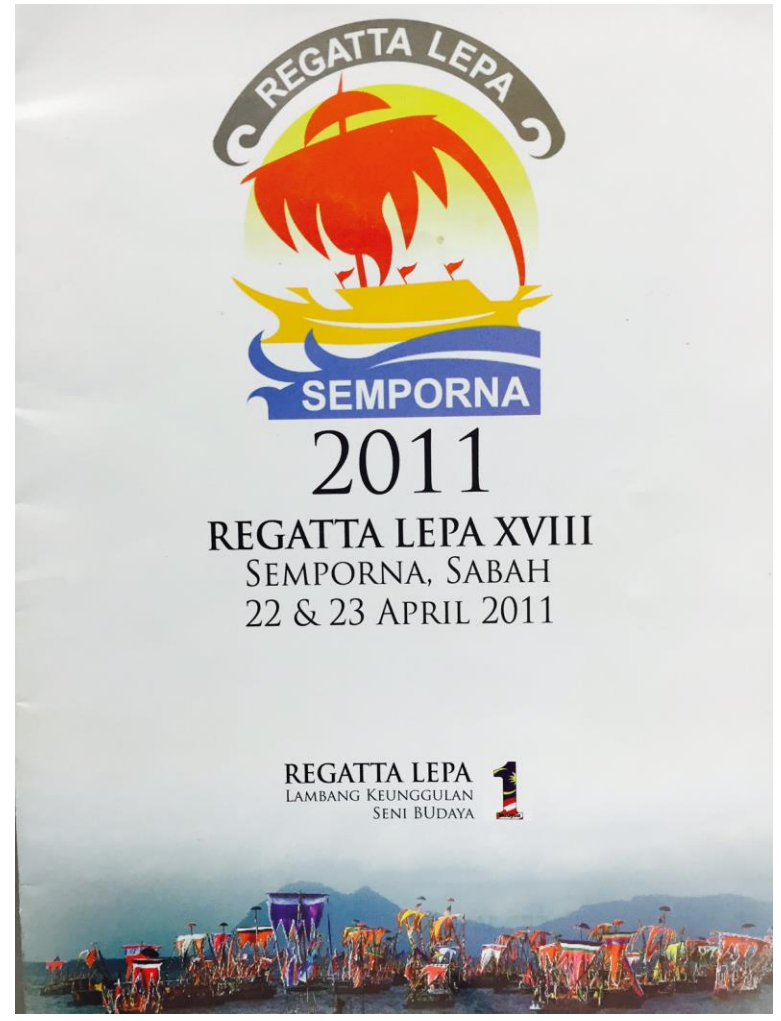
Figure 2: Cover Page of the 18th Regatta Lepa Festival

In marked contrast to that of the 36<sup>th</sup> Kamahardikaan Festival, the cover of the 18<sup>th</sup> Regatta Lepa Festival is a composition of order, balance and focus (Figure 2). Aesthetically, it is a visual essay of modernity as seen in the sleek and simple lines of the overall composition, the use of only two types and two colors of fonts, the plain and unadorned background and the dominant (if not hegemonic) location of the festival logo. The Regatta Lepa logo provides the visual focus of the composition. Although Semporna and Sabah figure as place names in the composition, they are not emphasized as local government or administrative units. Their seals do not figure in the composition.