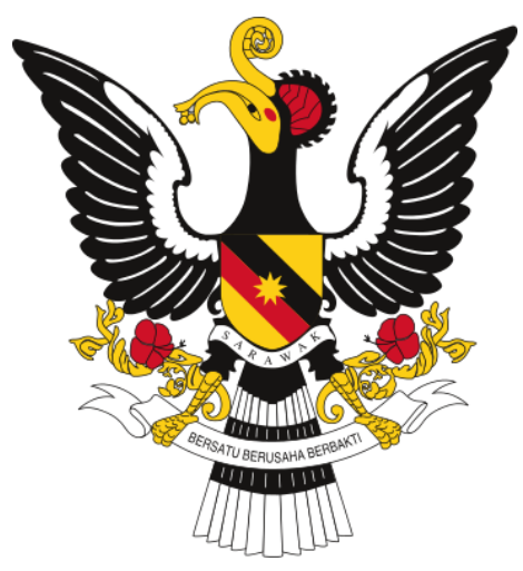
Illustration 6: Coat of Arms, State of Sarawak, Federation of Malaysia featuring the kenyalang