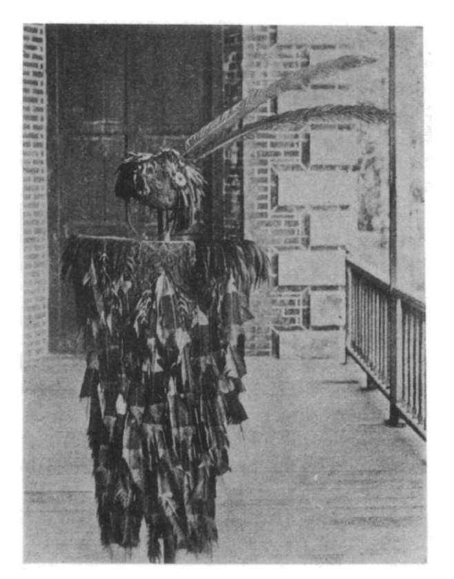
Illustration 2: Iban Dayak war coat and cap with Hornbill feathers (Source: Nyuak and Dunn [1906, p. 423].)

photographed from the verandah of a colonial-era house or building, the Iban Dayak war cape and hat expands upon the significance of the Hornbill from simply being a sculptural icon of the avian spirit, and implies a closer connection between the warrior ethos of the Iban Dayak and the associated martial "virility" that the war coat and cap, dressed by the actual feathers of the Kenyalang 's terrestrial manifestation, with the significance of the Hornbill itself as a visual icon that indexes key notions of the Iban Dayak's world view, cultural praxis, and social capital between a warrior class elite and their publics.