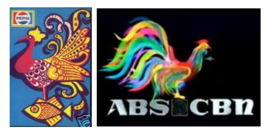
Illustration 8: Poster advertisement for identification logo of Pepsi Cola Philippines, circa 1970s.

In the modern Philippine setting, the royal signification of the sarimanok image has been coopted by both the state and private corporations during the 1970s as a symbol of native Philippine identity — and its implicit reference to both royalty and the political ascendancy of the non-secessionist Maranao in the eyes of martial law administrators, therefore becoming a coded text in "integrating" Muslim Maranaos to the national fabric, and the instrumentalization of their royal iconography for state and capitalist consumption and display. Examples of such designs include a mid-1970s poster advertisement for Pepsi Cola Philippines (Illustration 8) and the station logo of the media conglomerate ABS-CBN (Illustration 9), whose use of the sarimanok dates back to the late 1960s.