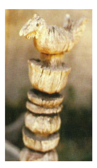
Illustration 11: Sama Badjao manuk-manuk from Sulu serving as gravemarker. Base upon which it is perched is in the tadju baunuh motif

As can be seen, the Sama Badjao manuk-manuk utilizes another aspect of the avian spirit figure: that of protector or guardian of the innocent (children) and the dead. The morphology of the manuk-manuk 's form, which despite its often miniature size can be clearly gauged in terms of anatomical details, seems to be a transitory form between the kenyalang and the sarimanok : it has a short, S-shaped neck that terminates in a proboscis-shaped beak; a beard of feathers carved in ukkil style (the Tausug equivalent for the Maranao okir ); a turtle-shaped body that lengthens into a miniature torpedo shape towards the tail; and a fork-shaped "paddle tail".