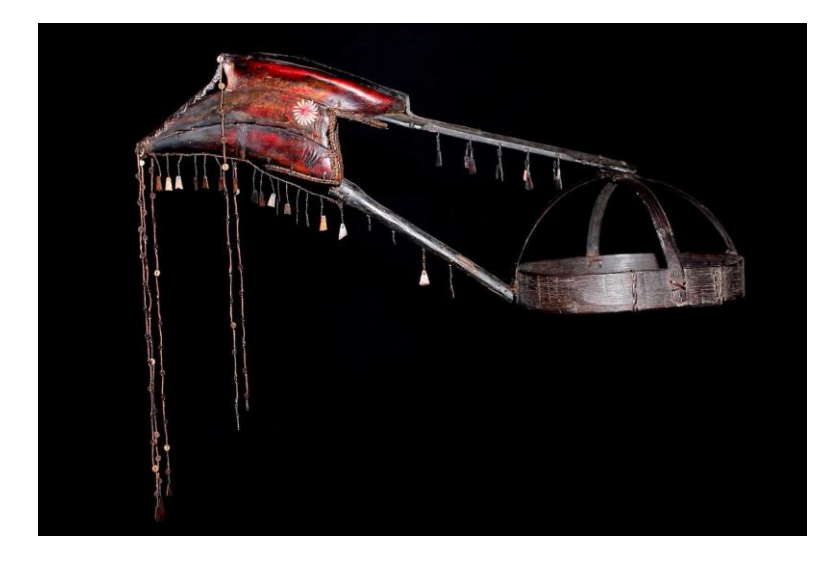
Illustration 12. The Ilongot panglao with its Hornbill skull and decorative shells projecting from the metal skullcap that affixes this assemblage to the wearer's head

ethnographic work of Rosaldo (1986), the Ilongots (also called Bungkalot) of Nueva Vizcaya Province wear ceremonial headdresses called panglao that centers on the skull and distinctly red beak of a Rufous Hornbill ( Buceros hydrocorax ), known in Filipino as kalaw . The hornbill skull and beak forms the climax of a decorative program for a male cap that starts with intricate adornments using shells and beads that are wound across the cap, and produces a tinkling sound when its wearer moves. Made in the context of promoting male virility and desirability as a potential mate for its wearer among women, the panglao was originally donned by young Ilongot warriors only upon the taking of a human head (emphasis mine). The Ilongots, like most of the other Cordillera peoples, were renowned and feared as headhunters, and Rosaldo's research identifies their wearing of the panglao as not coded within notions of male beauty and desirability, but also on the male warrior ethic as a preferred modality of "reproductive masculinity" within Ilongot society.