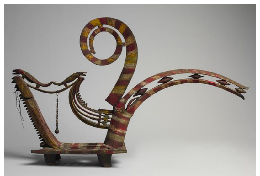
Illustration 5: Anak Kenyalang at the Metropolitan Museum of Art. Gift from the Fred and Rita Richman Foundation, 2007