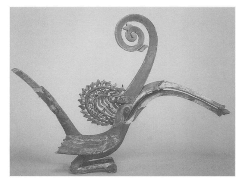
Illustration 4: Anak kenyalang sculpture at the Sarawak Museum

iconography of the anak kenyalang is simpler, more austere, and yet contains the fundamental elements that "empower" it as a "surrogate" to the bigger principal kenyalang (Table 3):