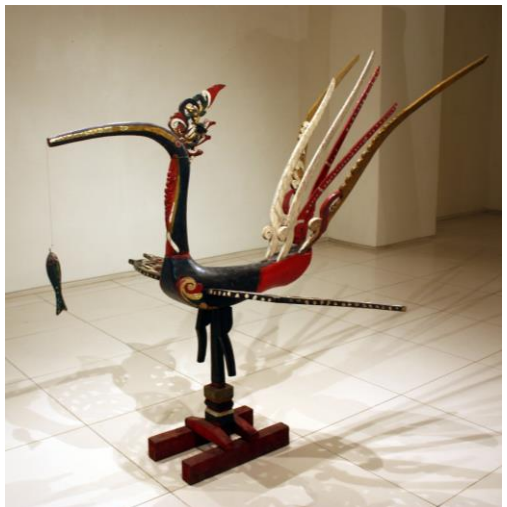
Illustration 7: Sarimanok sculpture from Lanao del Sur, circa 1970s (Asian Center Museum Collection)

The sarimanok is often described as a fancifully-feathered rooster or "bird", in which a small fish is then dangled from the tip of its beak. Another larger fish is also used as the base upon which the sarimanok stands, and is thus seen as "grasping" on to it. It is a figure that is often used as a decoration in carved, woven, or painted form. However, the most socially significant form of the sarimanok is when it is carved as a free-standing sculpture roughly 3-4 feet high by 4-6 feet long and 2-3 feet wide, with intricately carved nape feathers, wings, and extravagantly extended tail feathers, which is then often painted in bright polychromes. This is the form that one sees inside the houses of Maranao "royal families" in Marawi City (of which there are several dozens). A sample collected by the Philippine Center for Advanced Studies (PCAS) during the 1970s is now preserved at the Asian Center Museum Collection of the University of the Philippines (UP) Diliman ( Illustration 7 ). The abstracted