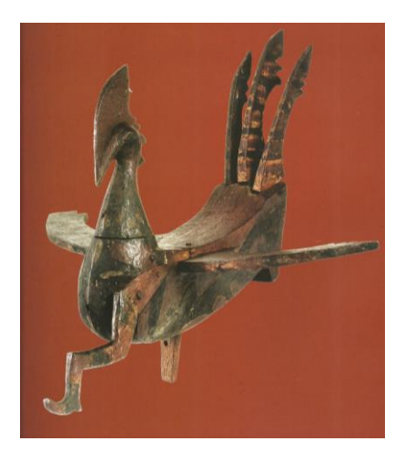
Illustration 10: Toba Batak manuk-manuk from the Museum Nasional Indonesia

An example of one such manuk-manuk can be seen from the collection of the Museum Nasional Indonesia (Illustration 10), in which the geometric and simplified form of the older kenyalang can be glimpsed from its austere composition. Sporting a conical neck climaxed with a downturned beak, simplified crown, and sporting plank-shaped wings and individually planked tail feathers that are eerily reminiscent of the sarimanok , the manuk-manuk 's primary differentiation is the lack of prominent legs. Instead, a peg-shaped spur that is used to plant the manuk-manuk to its bamboo pole serves as its base. However, this example from the Museum Nasional Indonesia also sports a strange "walking leg" motif that is human in origin. The "walking leg" obviously adds a visual cipher as to the manuk-manuk 's directionality when viewed from far below in the alaman .