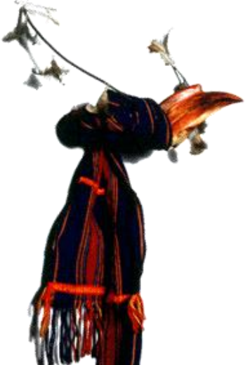
Illustration 13: The Ifugao ulo di kang-o with its hornbill skull and beak wrapped in red-and-black Ifugao textile

The Ifugao ulo di kang-o from the National Museum can be seen in Illustration 13.