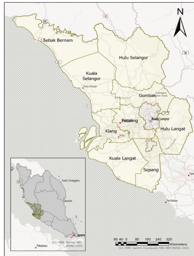
Figure 1: Map of Selangor showing the nine main administrative districts.

This study was conducted in a west coast state of Peninsular Malaysia known as Selangor. Selangor is in the northern part of Perak, Pahang on the east, Negeri Sembilan on the south, and Strait of Malacca on the western part. This state is located between latitude of 3.0738°N and longitude 101.5183°E. This state also consists of nine main administrative districts (Figure 1) and 54 subdistricts. The capital state of Selangor is Shah Alam while Klang is the royal capital. The total area of Selangor is 7,951 km 2 (3,062.2 sq mi) and the total population of Selangor in 2021 was estimated to be 6.56 million.